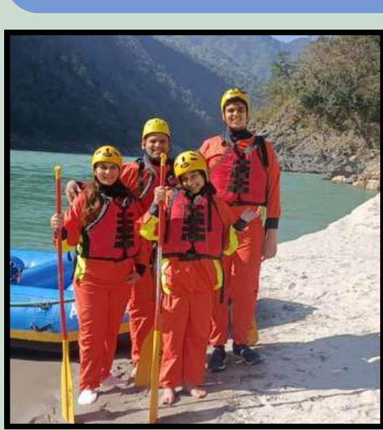
Kayaking in Rishikesh rapids with my family