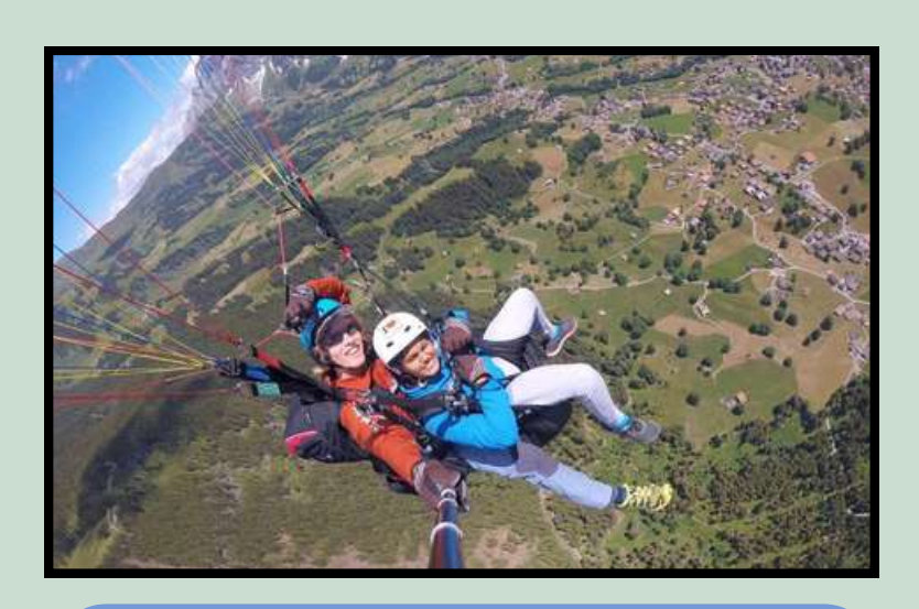
Paragliding 4000ft above Grindelwald